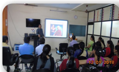
ICT Enabled Classroom Teaching