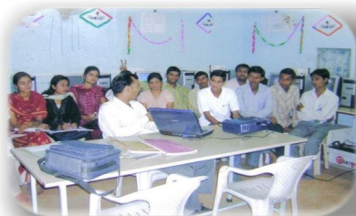
A Classroom Discussion Session